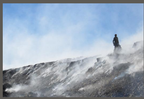
Emitting an offensive odour from an activity or premises

R10million and/or imprisonment of 10 years;