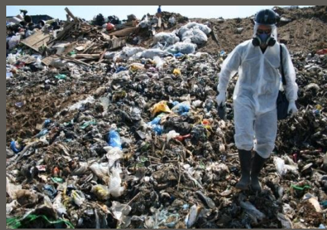
Operating a waste disposal site without a waste management licence

Section 67 read with 20 of the National Environmental Management: Waste Act, 2008;